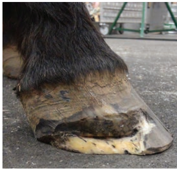
March 2021 - using Dremel tool to get final clean up at juncture of wall and laminae.