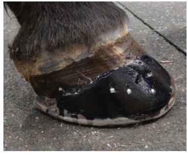
March 2021 - after clinching, note the ledge of material at top to help with bond.