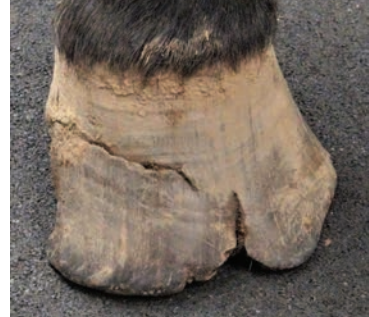
March 2021 - missing wall and lateral Toe quarter undermined.