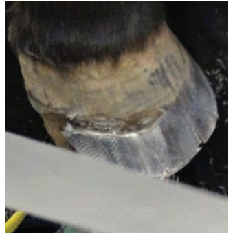
March 2021 - rasping outer wall to get indication of true shape.