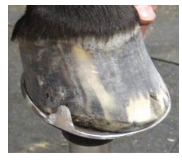
In June 2021 reset, very little patch needed to fill void in toe quarter.