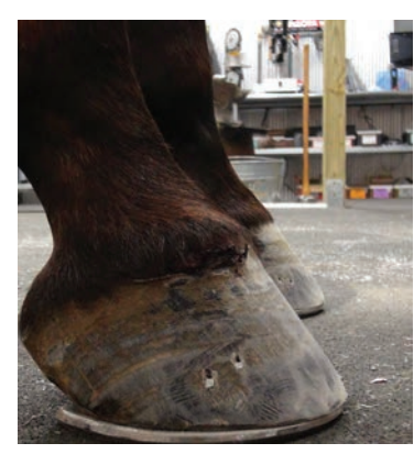
July 2020 - shod with Diamond Tracker Shoe.