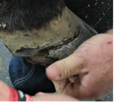
March 2021 - Hank starts to investigate damaged wall.