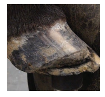
By late April 2021 hoof is growing down and a much smaller area requires the Adhere patch.