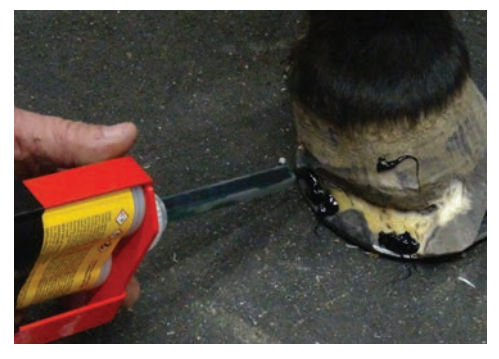
March 2021 - applying first layer of Adhere.