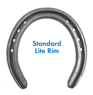
chart below shows how the dimensions of the shoes have changed. The change is minimal, and we hope the combination of the two styles into one will be more efficient for you.

The Kerckhaert Standard Rim series has been replaced with the Standard Lite Rim. The Standard Lite Rim 0, 1 and 2 are now available in the new dimension: sizes 000 and 00 will be avialable soon. Standard Lite Rim size 2 is a new size for the range. The