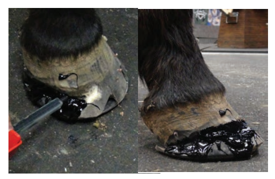
March 2021 - application of second and third layer.