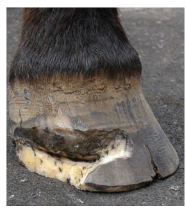
March 2021 - additional wall resection and clean up, removing anything not attached or healthy.